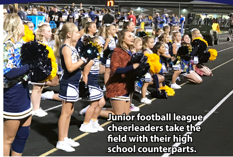
Junior football league cheerleaders take the field with their high school counterparts.

Please contact your child's school with questions about the program.