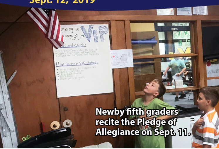
Newby fifth graders recite the Pledge of Allegiance on Sept. 11.