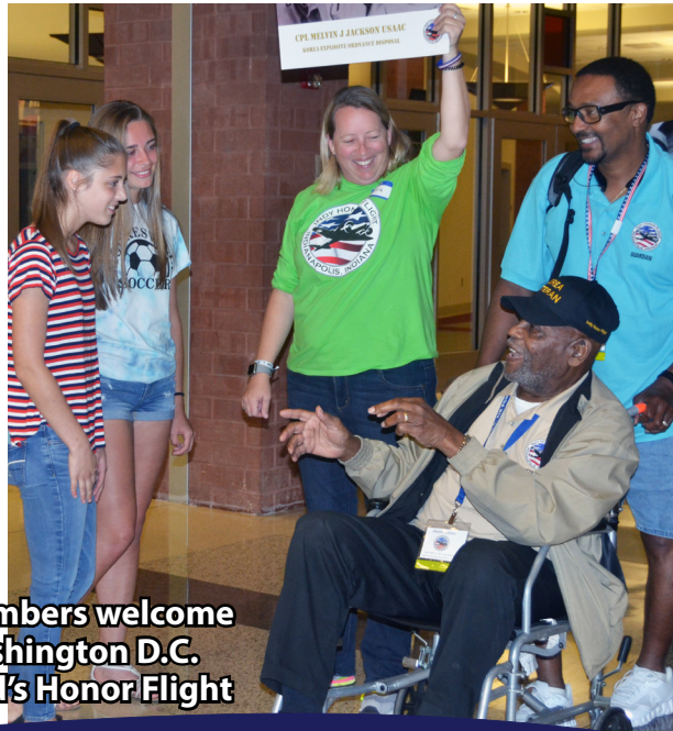
MHS Key Club members welcome veterans from Washington D.C. after this weekend's Honor Flight